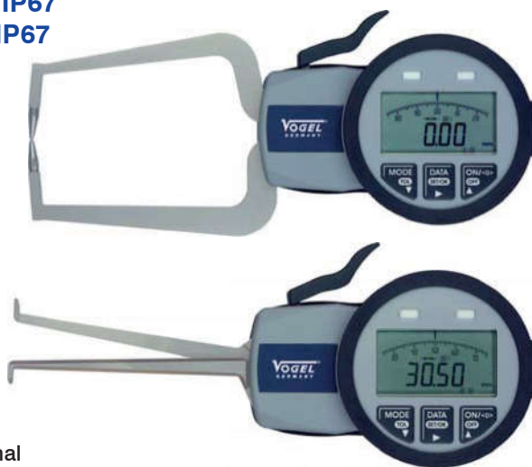
D = form of measuring contact points external