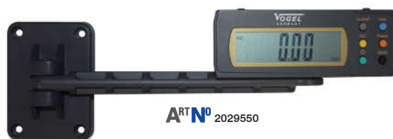
ART NO 2029550