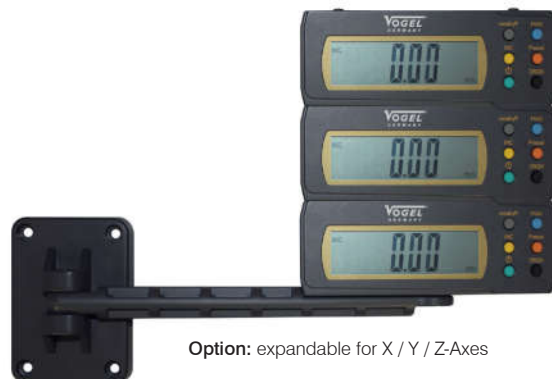
Option: expandable for X / Y / Z-Axes