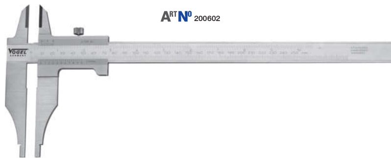
ART N° 200602