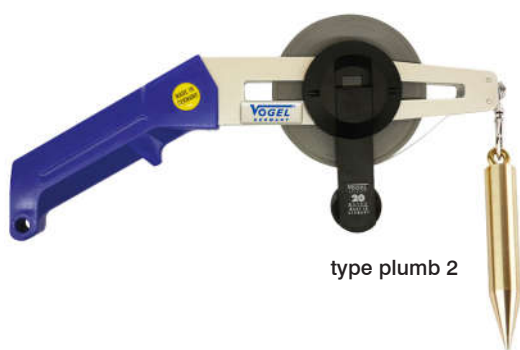
type plumb 2