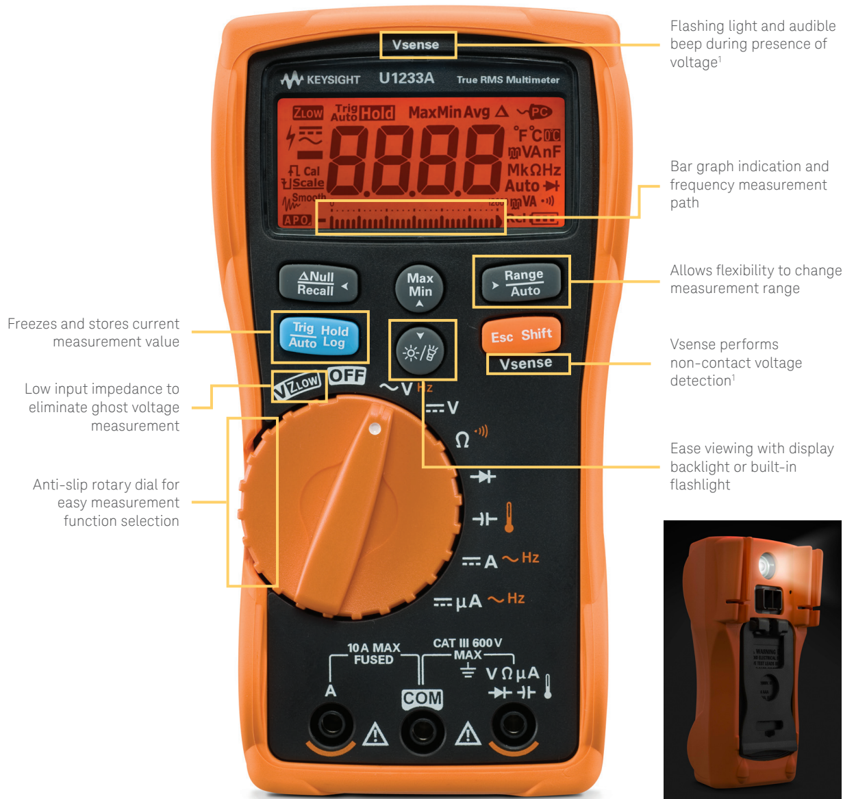
Figure 1. U1230 Series front view