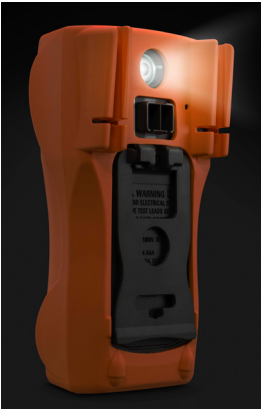
Figure 2. The built-in flashlight as illustrated