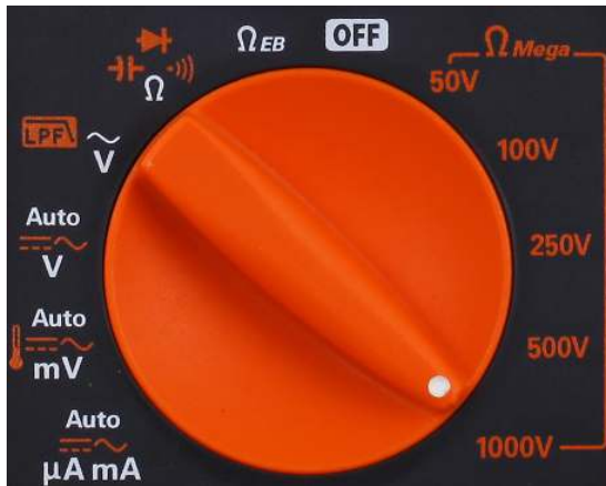
Figure 6. Insulation resistance tester with full featured DMM