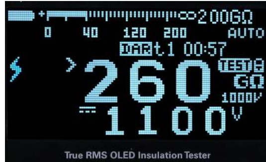
Figure 5. Adjustable insulation test voltage up to 1.1 kV

The adjustable insulation test voltage from 10 V to 1.1 kV in 1 V steps on selected two models 1 allows you to set precise test voltages catered to unique test application requirements. These typical applications are commercial avionics testing, military communications system testing and production line testing. The standard test voltages from 50 V to 1 kV is also available for selected models 2 .