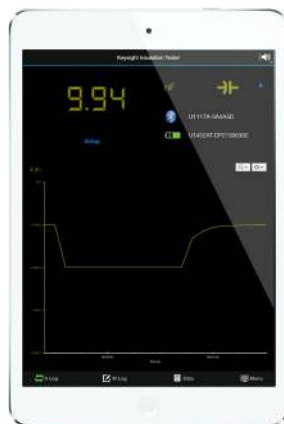
Figure 3. Data logging interface on Keysight Insulation Tester Application