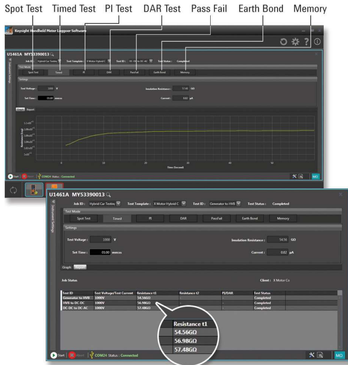
Job Status Reporting View

Eliminate the conventional data entering process and get error-free automated test reports generated in a tabulated or graphical form for easy interpretation and analysis – essential for troubleshooting, commissioning and preventive maintenance tasks. Better yet: All five insulation testers are compatible with the U1117A IR-to-Bluetooth® adapter to enable wireless remote testing using Windows PC 1 or on iOS/Android smart devices. 2