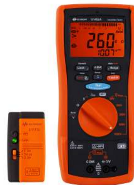
Figure 4. U1117A IR-to-Bluetooth Adapter enables wireless remote testings with the U1450A/U1460A series