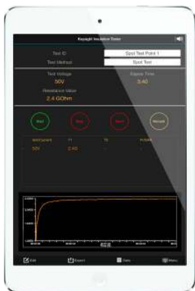
Figure 2. Perform remote testing with Keysight Insulation Tester Application